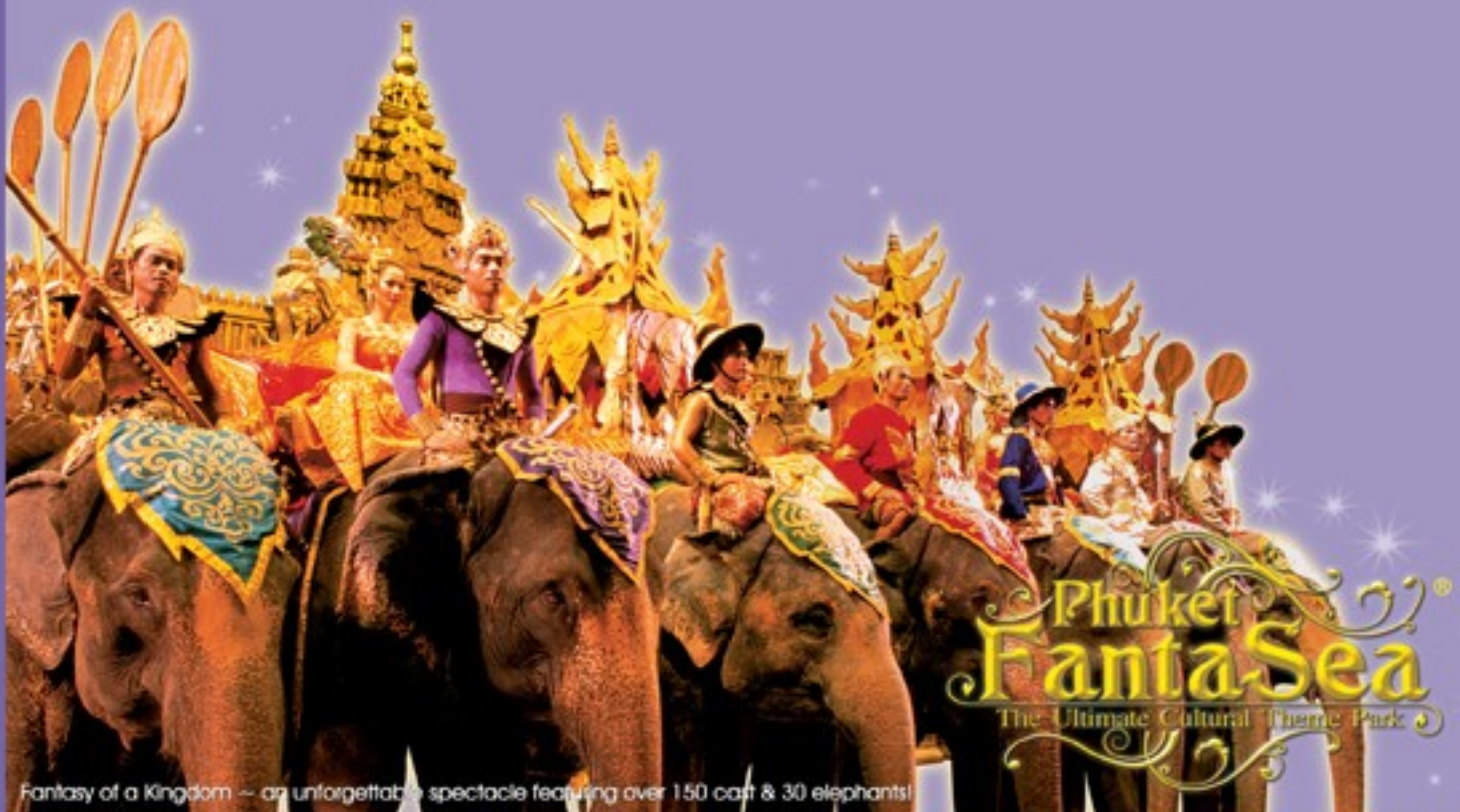
Fantasy of a Kingdom -- an unforgettable spectacle featuring over 150 cast & 30 elephants!

Cultural Illusion theatrical show Buffet restaurant Seafood buffet restaurant A la Carte & fast food restaurants Beer garden & drinks bars Coffee shop Shopping village Cultural parades Street shows Carnival games Mascot meet-and-greet Handicraft demonstrations Thai costume rental & photography Live performances Fireworks extravaganza (on pre-announced dates only) Live band & Thai classical music Elephant riding and feeding Carp viewing & feeding Giant Mekong catfish viewing & feeding Safari adventure walk Ice cream & dessert parlor