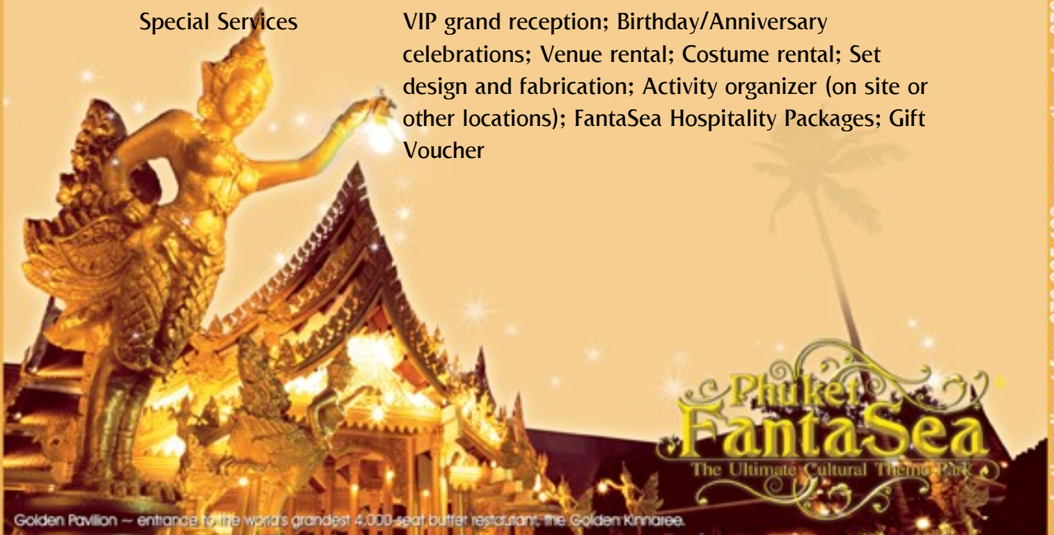
Golden Pavilion -- entrance to the world's grandest 4,000-seat buffet restaurant, the Golden Kinnaree.

VIP grand reception; Birthday/Anniversary celebrations; Venue rental; Costume rental; Set design and fabrication; Activity organizer (on site or other locations); FantaSea Hospitality Packages; Gift Voucher