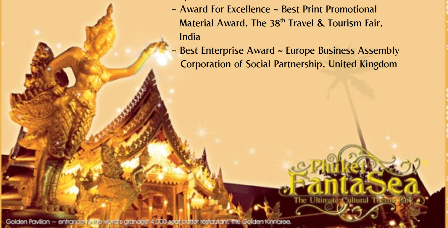
Golden Pavilion -- entrance to the world's grandest 4,000-seat buffet restaurant, the Golden Kinnaree.

Major Awards - Award For Excellence ~ Thomson UK - Thailand’s Best Attraction Award ~Tourism Authority of Thailand - International Award for Tourism, Hotel & Catering Industry ~ Trade Leaders’ Club, Spain - Global Quality Management ~ Spain - Golden Award for Quality & Business Prestige ~ OtherWays Management & Consulting Association, France - T.Q.M. Total Quality Management Aptitude Seal For High Quality Performance & Best Customer Satisfaction ~ France - “5 Stars Level” Award for The Halal Food Services Standard for Tourism~ Department of Tourism, Ministry of Tourism and Sports, Thailand - Public Restroom Standard (International Level) ~ Department of Tourism, Ministry of Tourism and Sports, Thailand - Award For Excellence ~ Best Print Promotional Material Award, The 38 th Travel & Tourism Fair, India - Best Enterprise Award ~ Europe Business Assembly Corporation of Social Partnership, United Kingdom